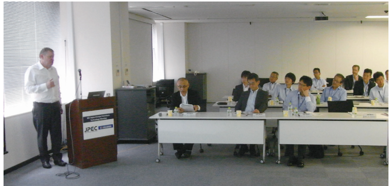
International conference with European petroleum organizations